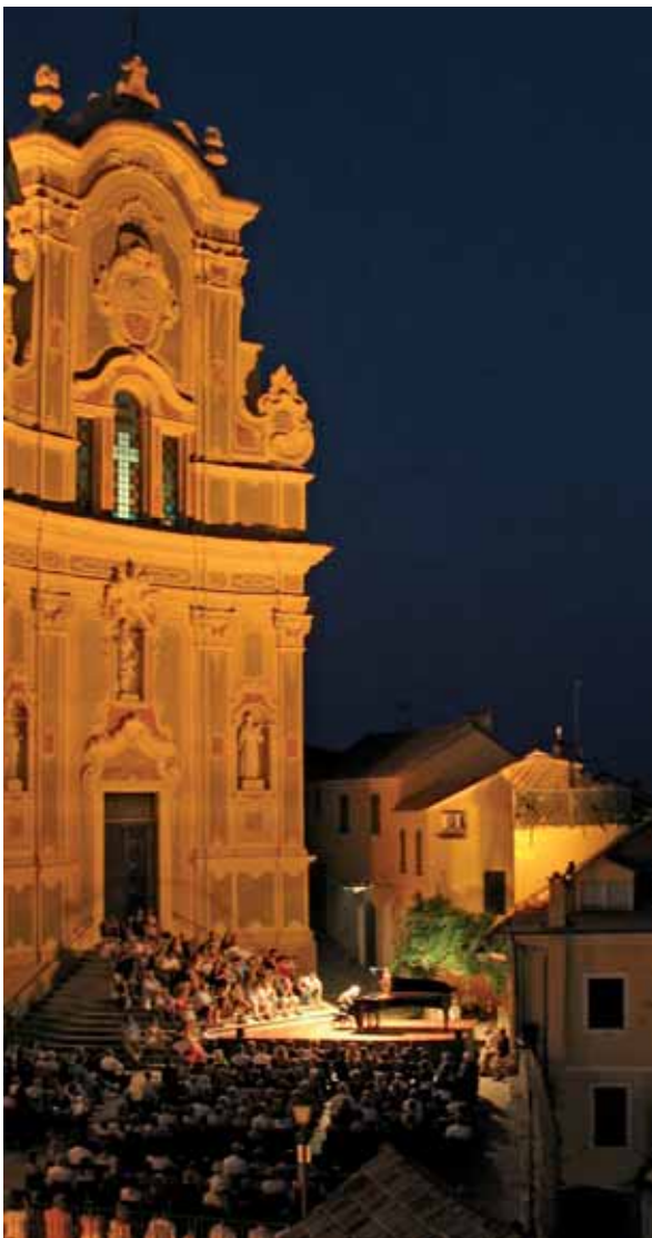
Chamber Music Festival - Cervo