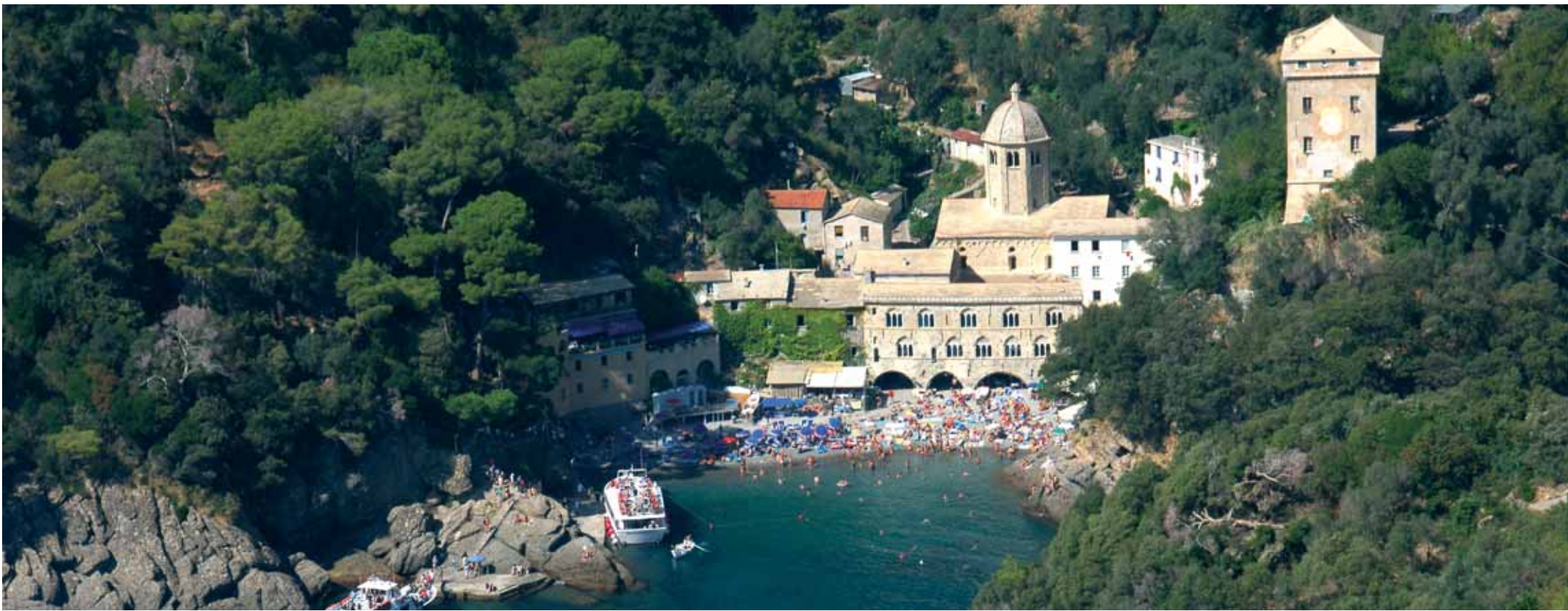
Abbey of San Fruttuoso of Capo di Monte

miraculous events and apparitions of the Virgin Mary; furthermore, in the hinterland, many religious buildings bear witness to monastic orders that were able to convert even the wildest islands.