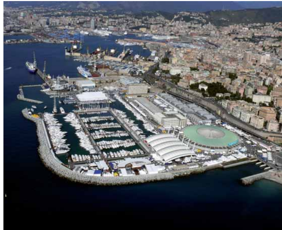
Genoa Exhibition Centre

Once every two years, the city that boasts the most famous aquarium in Italy hosts Slow Fish , an event sponsored by Slow Food and the Liguria Region. The subject of sea ecosystems is discussed through meetings, workshops, tasting, and conferences. Culture tastes like sea salt, and it's nice to unveil it while shopping in the market areas, or while enjoying nice dishes in the many restaurants and bistros. The options are so many it's hard to know what to chose!