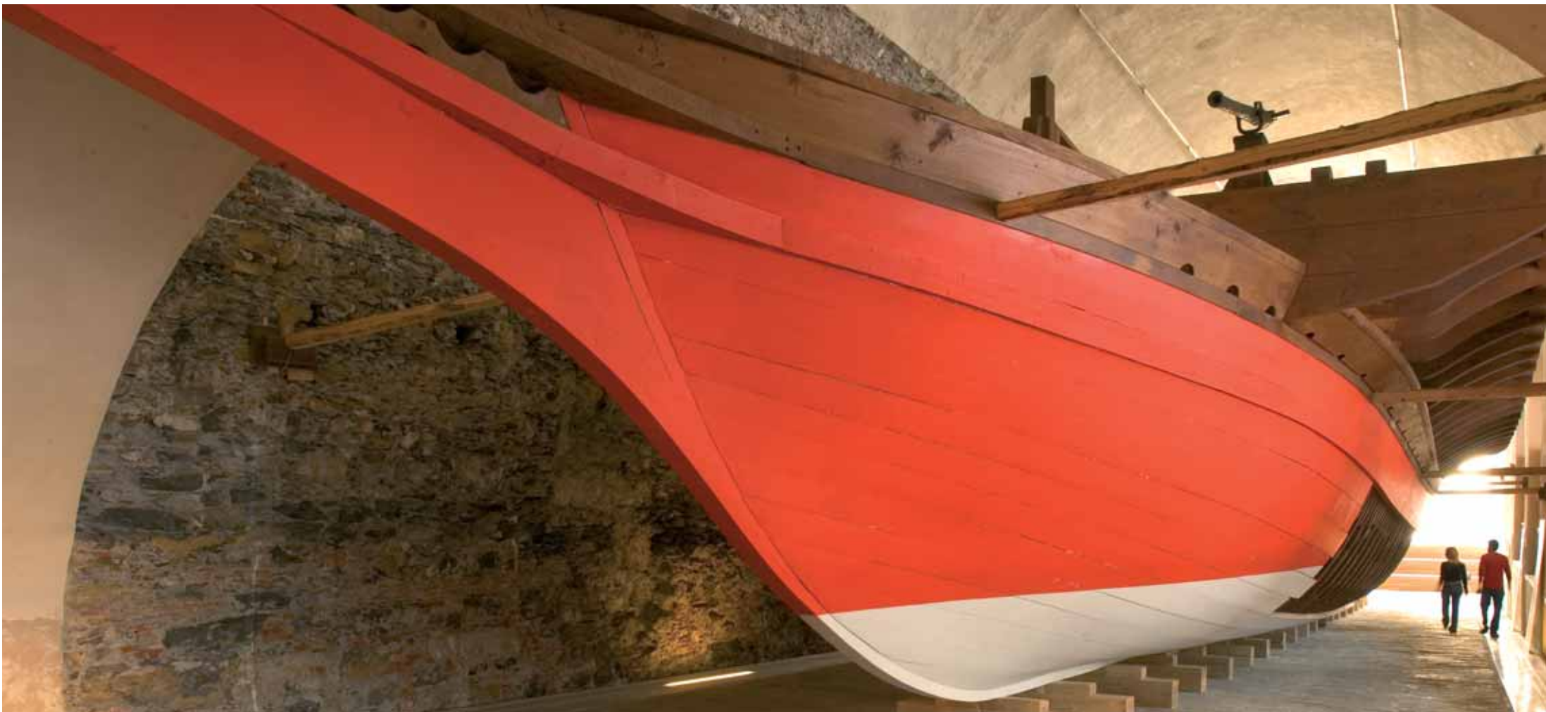
Galata Maritime Museum

Figureheads, relics of battles, medals, decorations, anchors and Chinese junks are on display at the Naval Technical Museum of La Spezia , whereas Camogli dives into its ancient routes in the exhibition rooms of the Civic Maritime Museum Gio Bono Ferrari , among nautical instruments, documents and images of sailing ships, ordered by ship-owners to complement the furniture of their offices: memories of tormenting and glorious