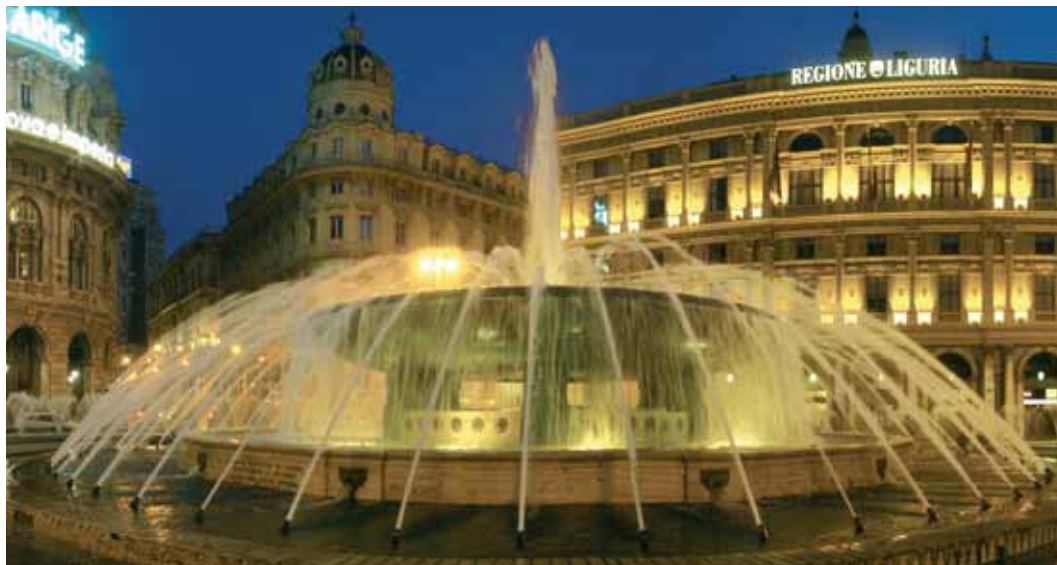
Piazza De Ferrari - Genoa

Genoa seems split between two beating hearts - the triumphant rhythms recalling a 15th century Golden Age, with its wharf door Porta Siberia , Palaces like Palazzo Ducale and Palazzo Andrea Doria , and the villas outside the ancient walls; and the sadness of the blues beat resounding across fishermen villages.