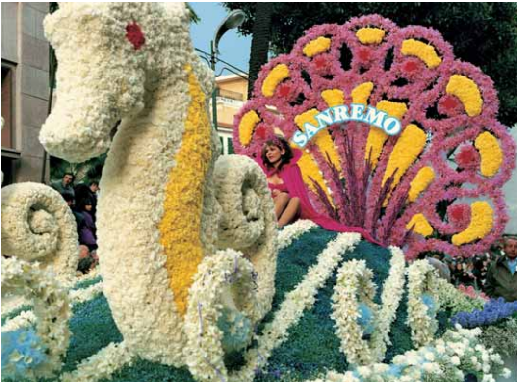
Blossomed Avenue - Sanremo

Silence please, the curtain rises, Liguria comes on stage. With an extraordinary events calendar the entire region always offers theatre performances, especially since 1992 when Genoa was in the spotlight for the 500th anniversary of Columbus , and afterwards, in 2004, with its nomination as European Capital for Culture .