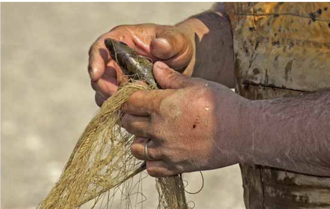
Mending fishing nets