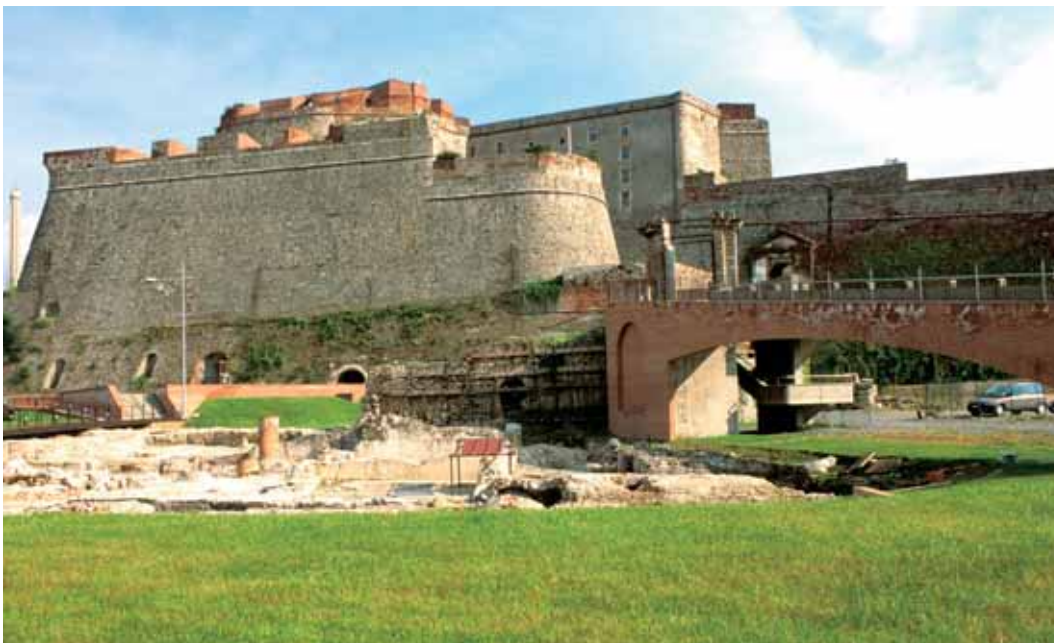
Fortezza del Priamar - Savona

Liguria, like Jurassic Park: the region finds its ancient memories in stone engraved graffiti in the Caves of the Balzi Rossi dating back to the Upper Palaeolithic, in the Caves of Borgio Verezzi and Toirano , and the Cavern of Madonna dell'Arma located in Bussana di Sanremo . A leap in time to find memories of Roman Civilisation, having defeated the Ligurian population and built viaducts, theatres, streets - like the well known Aurelia -, churches such as San Paragorio in Noli , and many buildings, which are today partially visible in the archaeological sites of Albenga , Ventimiglia and Luni . To those who would like to have an overview of Ancient Liguria, the Archaeological Museum of Finale , enclosed in the monumental complex of Santa Caterina, offers a complete vision of the history of the Finale area, with its prehistoric and archaeological collection, boasting unique pieces.