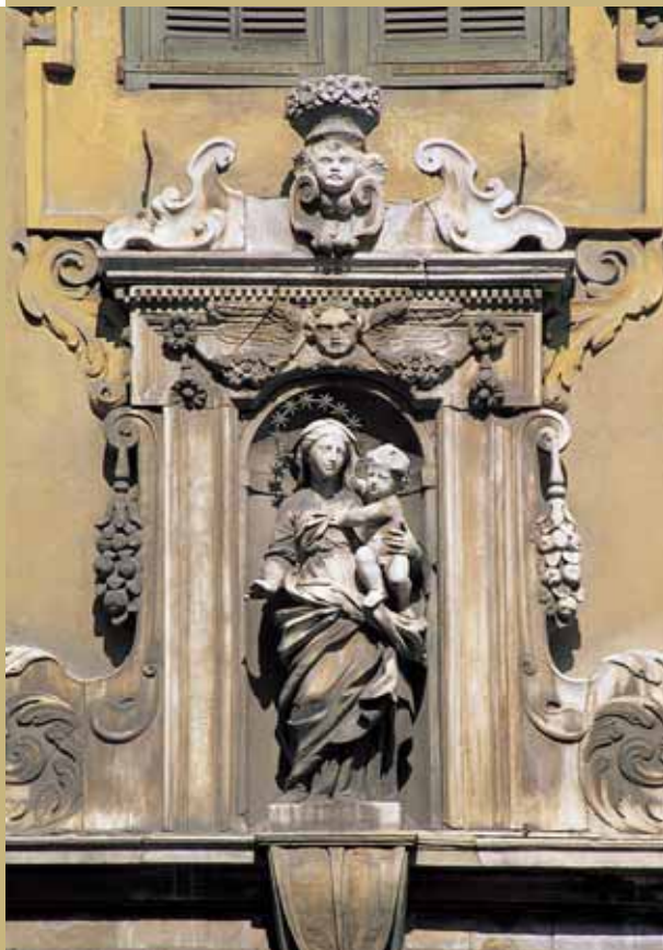
Sanremo - Imperia

Agenzia Regionale per la Promozione Turistica “in Liguria”