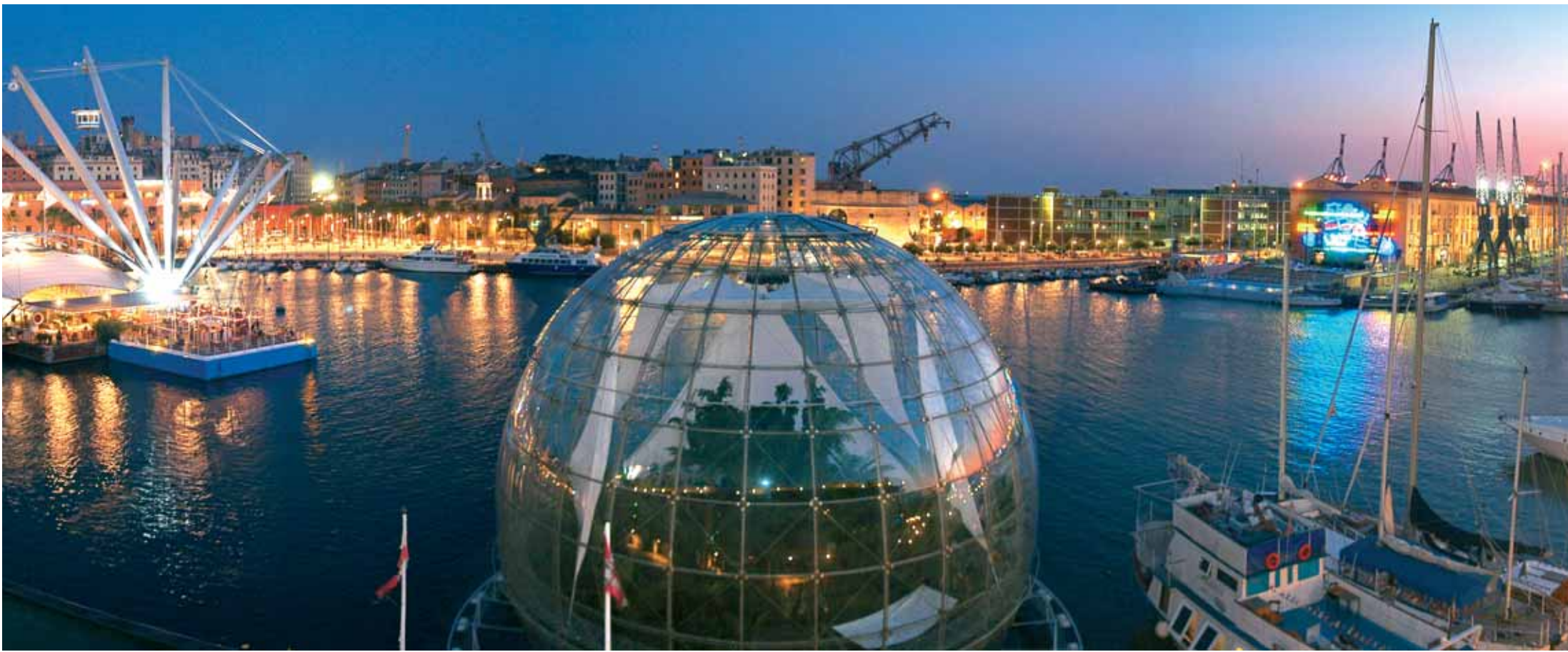
Overview of the Old Harbour- Genoa