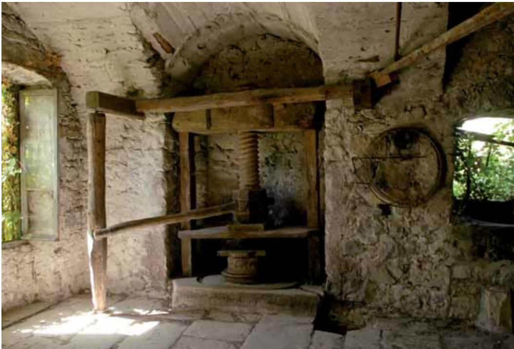
Ancient Oil Mill - Olivetta

In Liguria, even daily life is an attraction. You just need to stop to watch the carpenters and caulkers working in big sites on the restoration of antique yachts, or to follow the ancient practices of joiners in the city of Chiavari when they steam-bend wood and press-mould it, the way Mr. Gaetano Descalzi, called "il Campanino", used to do. This 19th century master manufacturer produced chair models like the "three arches" and "Parisian" and invented the characteristic "chiavarina" chair, with its light joint structure and straw cover in Indian Cane draw.