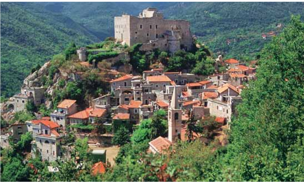
Castelvecchio di Rocca Barbena

The wonderful historic centre of Albenga shows examples of open-air art: the main square, Piazza S. Michele, is the heart of the city with the Cathedral and its bell tower, considered one of the most valuable late Gothic monuments in the region. A few steps away, the decagonal shaped Baptistery still remains intact since the 5th century.