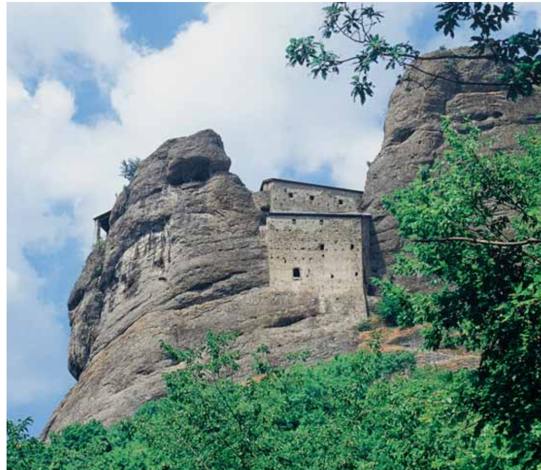
Stone Castle of Vobbia

At Christmas time the wonderful live nativity of Pentema is an unmissable chance to experience a performance in traditional costumes that captures the spirit of Christmas in the unique setting of a medieval little town! In the nearby area, you can visit the ancient stone ruins of the Stone Castle of Vobbia , which was built along the Salt Road.