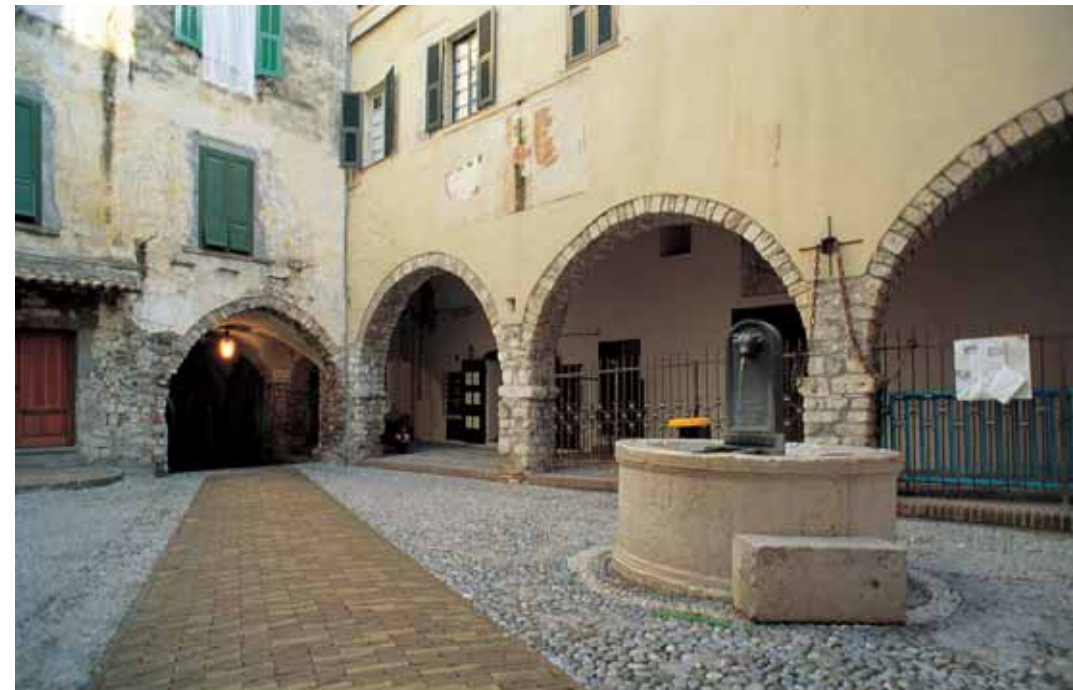
Sanremo - Historic Centre "La Pigna" - Square "Piazza dei Dolori"

As in the best fairy tales, this itinerary tells of witches and stakes, of mysterious artists reviving old abandoned towns, tales of legends about the preparation of traditional dishes, of little alleys where houses are so close to one another they almost seem to touch, and it also tells of enchanted lands. And then of battles between Saracens and the proud people of Liguria, through hidden paths and sandy expanses.