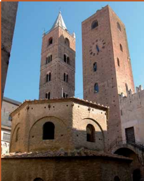
Albenga - Savona

Agenzia Regionale per la Promozione Turistica “in Liguria”