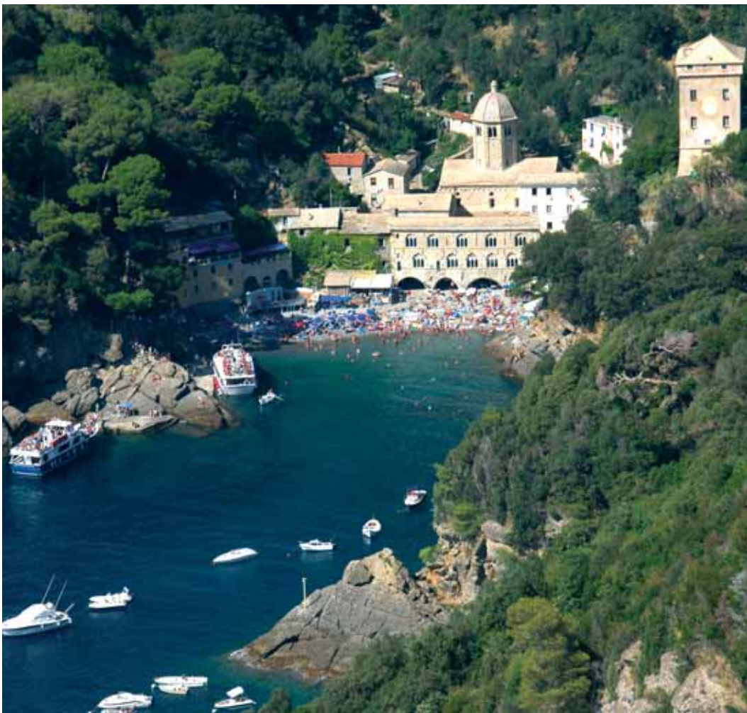
Abbey of San Fruttuoso di Camogli

You simply can't miss the famous little sea town of Camogli . Here you can walk among coloured boats where the fishermen mend their nets, immersed in the nice smell of focaccia. This spot of Liguria is perfect for winter or summer excursions, and from here you can also easily reach the beautiful harbour by the Abbey of San Fruttuoso di Camogli . A real gem along the coast, and a good excuse for a pleasant fish meal after a nice boat tour.