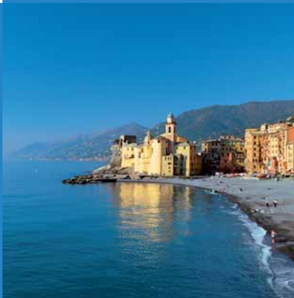
Camogli - Genoa

Agenzia Regionale per la Promozione Turistica “in Liguria”