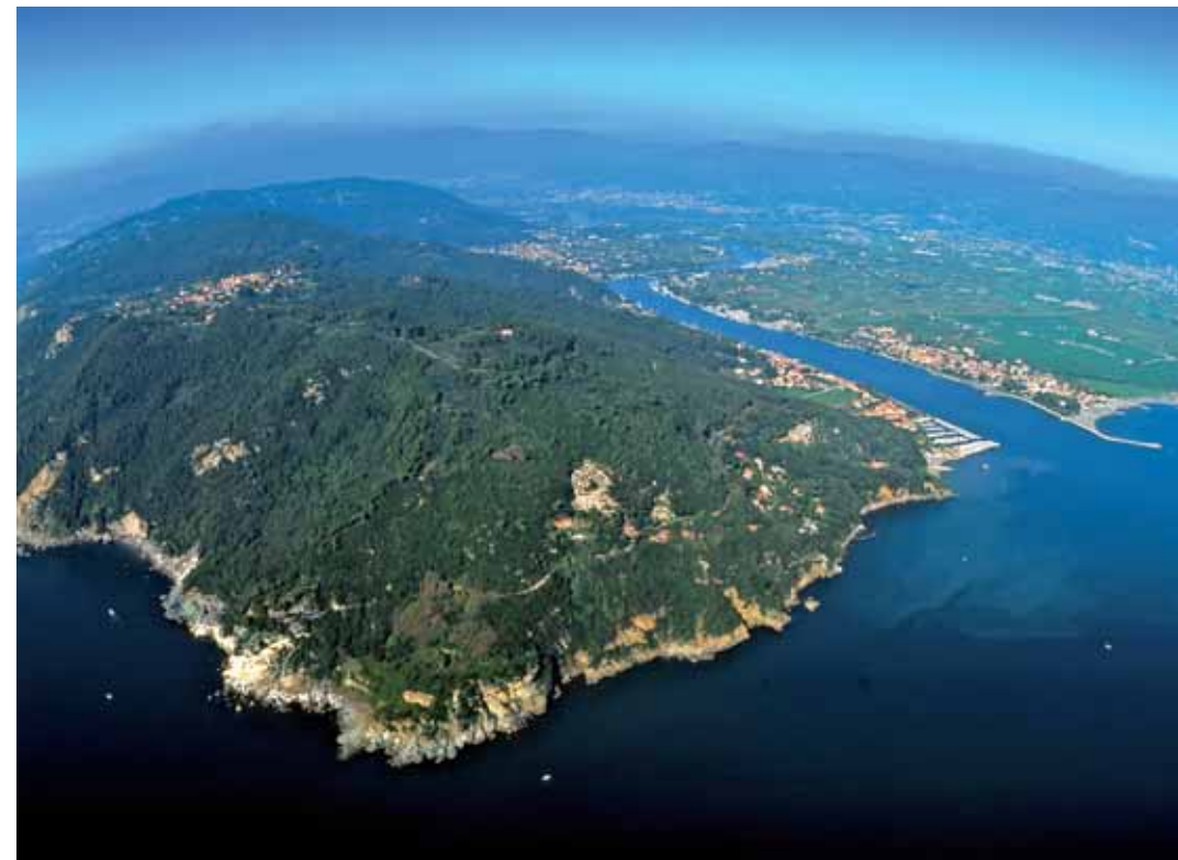
Bocca di Magra