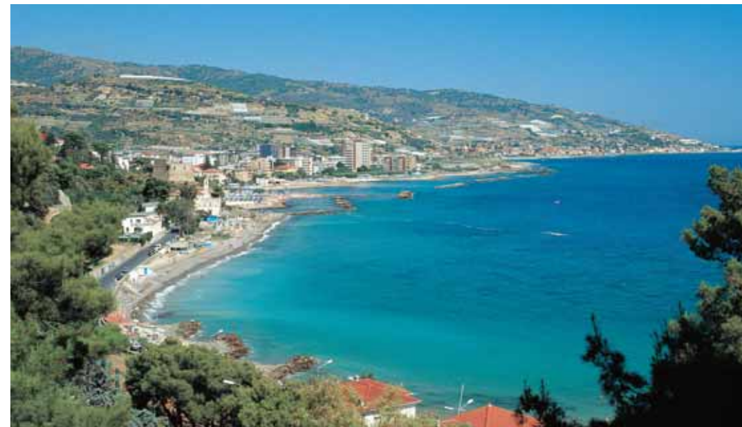
Arma di Taggia

Thousands and thousands of words would still not be enough to describe the beauty of Riviera dei Fiori. The landscape is very varied along the coast - from sand, to pebbles, to cliffs. Thin sand in the bays of Sanremo , golden tongues in Diano Marina and Arma di Taggia , cliffs at Capo Sant'Ampelio and Capo Cervo , - where the waves bubble and cling, mumble and swarm with life, in the inlets of smooth pebbles. The varied coastline turns into valleys, gorges and mountain peaks at an altitude of 300 metres. A whirl of landscapes for a wealth of experiences to live night and day in the lively cities, while hiking in the woods, or plunging in history inside medieval little towns.