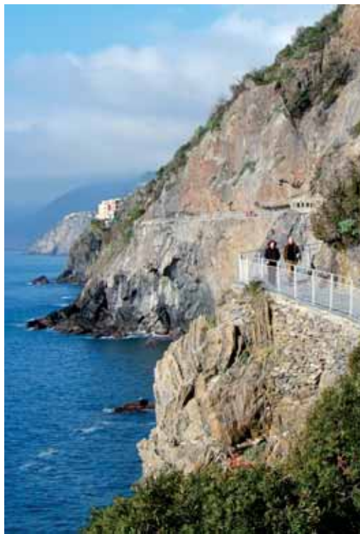
Via dell'Amore (Lovers' Walk)

A little town with light and shadow effects, sunshine and refreshing darkness along the alley walls. Riomaggiore, founded in 1250 in between two steep hills, enchanted the Florentine painter Telemaco Signorini with its beautiful colourful houses, the Church of San Giovanni Battista, and the ancient fishermen village located around the beach of Marina Piccola .