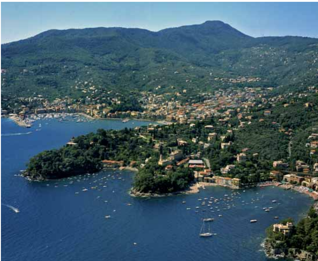
San Michele di Pagana