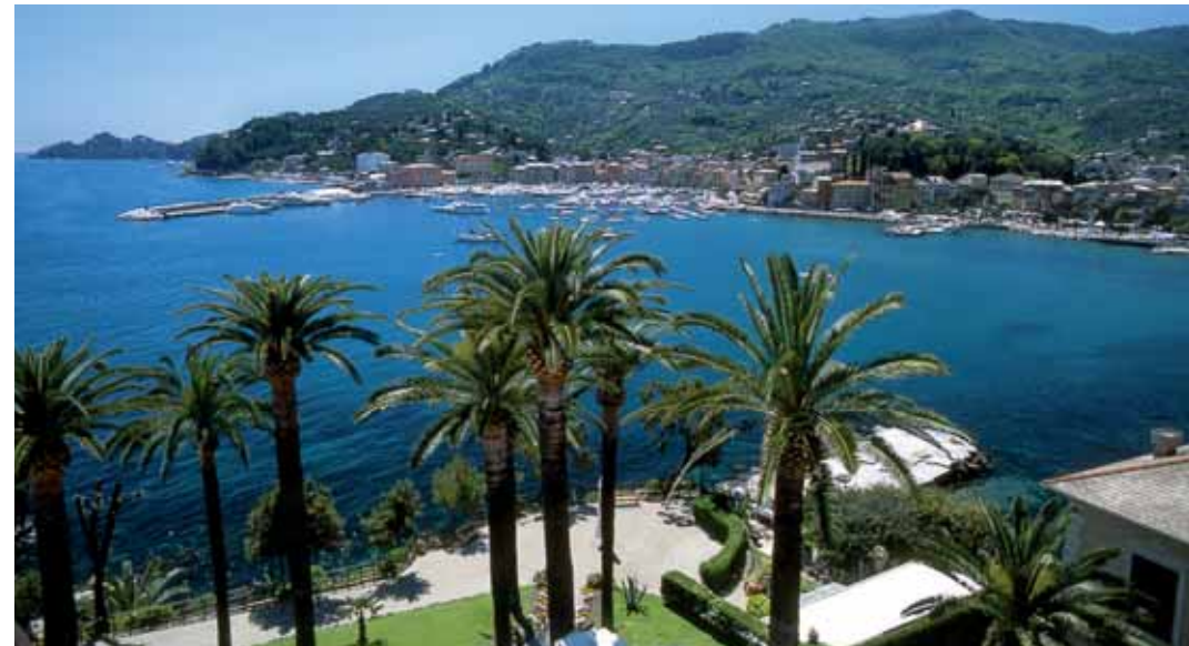
Santa Margherita Ligure.

Portofino does not only mean architectural heritage (with examples like the Church of San Martino and the Brown Castle ), it also means nature and landscapes. Off the Portofino promontory, in fact, a Sea Reserve is divided into three areas: the first one is enclosed in the creek called Cala dell'Oro ; the second one, stretching from cape Punta del Faro to cape Punta Chiappa , - where you can see a variety of sea fans, red coral, and the beautiful sea fauna; and the third, an immense undersea meadow of Posidonia. You can swim in the blue sea or enjoy a diving session to discover the Mohawk Deer wreck, and then visit the green Park of the Mount of Portofino , with over 700 different flora species. For an unforgettable tour we suggest you walk or take the ferry boat to the Abbey of San Fruttuoso, a site protected by the National Trust for Italy. The complex is located in a fantastic panoramic spot, in a deep inlet in the indented coastline of the Promontory, and you may visit it any time of the year - experience the emotions of pilgrims following in the footsteps of 14th century monks.