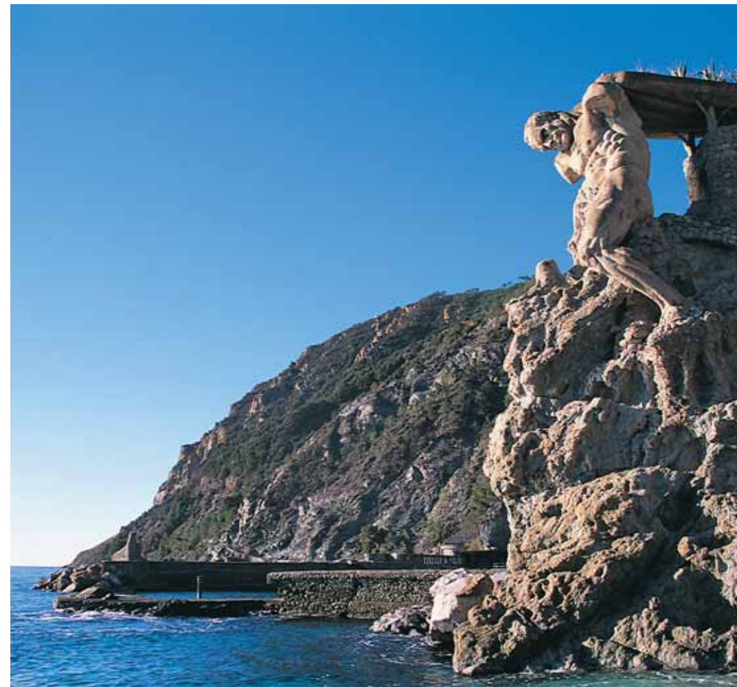
Monterosso al Mare

The nearby Corniglia, Roman little town enclosed on three sides by vineyards, has an agricultural tradition too.